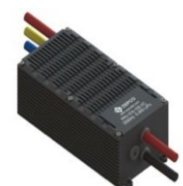
Electronic Speed Controller