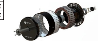
“Made-in-India” drone motor with Indian magnets