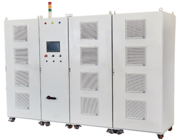
360kW shaker power supply