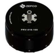
16kW Drone motor – High altitude logistics variant (world record set at 19,000 feet lifting 30Kg)